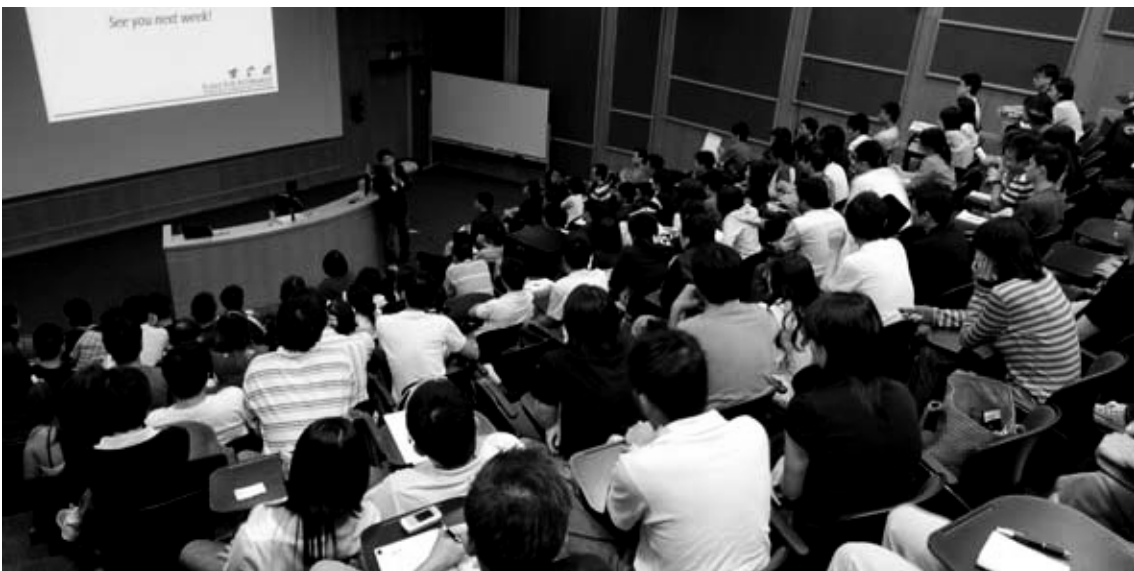
Monthly courses receive overwhelming response!

coming a more and more difficult to avoid. Our local corporations are now expanding overseas, and this leads to foreign currency and asset exposure. They are also affected by events that occur globally. A recession in the UK can directly affect a local company, if it sells mainly to the UK. This is unlike 20 years ago where investors could invest solely on companies that operated locally.