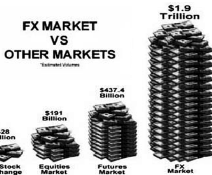
Sheer size of the forex market prevents manipulation

Winston Ng, CEO, Forex Driving School. They conduct Singapore's only structured 8-week Forex Mastery course that combines knowledge with a guided process through live currency market scenarios. Beginners to advanced traders attest to their amazing education process through the flood of testimonials and referrals to their monthly sell-out courses.