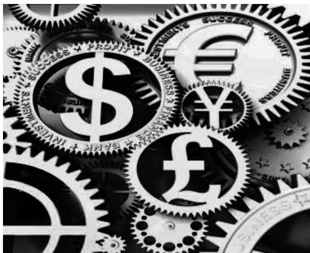
Making passive income through forex trading